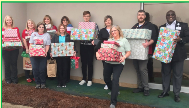
Houston County Healthcare provided many gifts