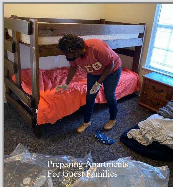
Preparing Apartments For Guest Families