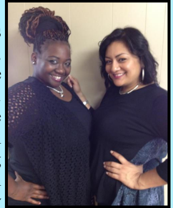
Two of our guests getting ready for job interviews