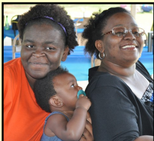
Some of the folks attending the picnic.