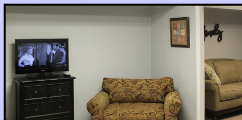
Above: The Quiet Room

Left: Two adjoining family rooms for our guests to enjoy.