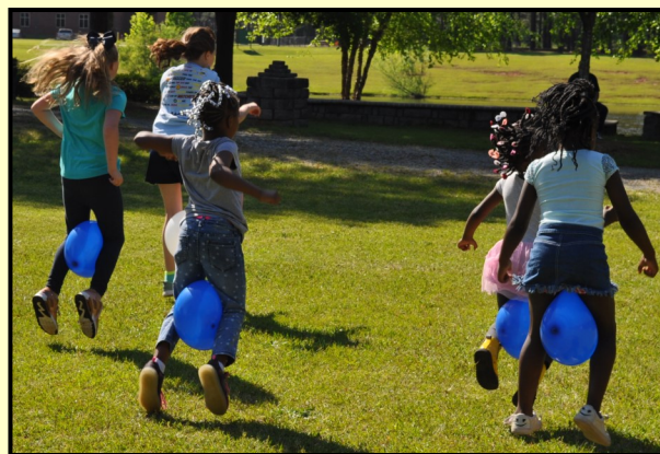
The kids had a great time playing the Balloon Race Game.