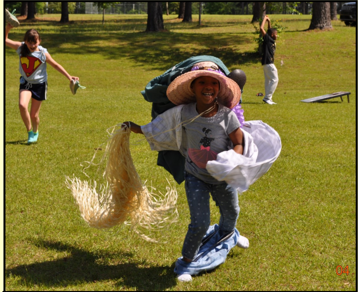
Children having fun!