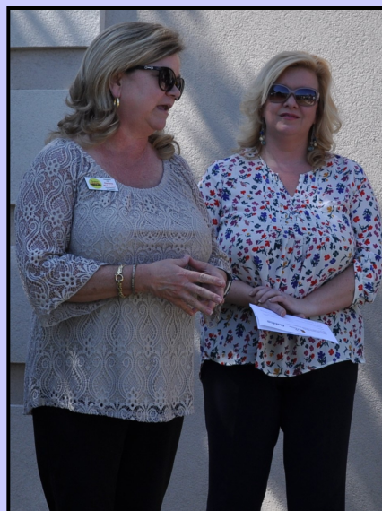
Chamber Leaders welcome Family Promise to this new location.