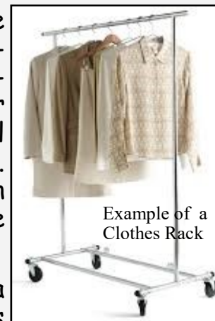
Example of a Clothes Rack

On page 5 you saw a picture showing part of our activity room. The other end of the room has exercise equipment for adults and older children to use. One of our wishes is to also have a Foosball game for our guests to play. Would have a one in good condition that you no longer need to donate or could your group provide one?