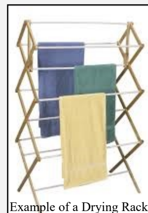
Example of a Drying Rack